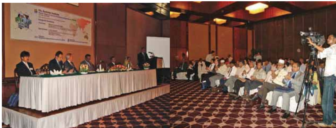
Inaugural Ceremony of PRSCO Summer Institute in Bangladesh

Development Goals (MDGs) in collaboration with United Nations Development Program (UNDP). The sessions took place in the Pan Pacific Sonargaon Hotel during 15–16 May 2008.