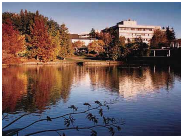
The Population Studies Centre, University of Waikato, New Zealand

For further information, see http://www.waikato.ac.nz/wfass/populationstudiescentre/