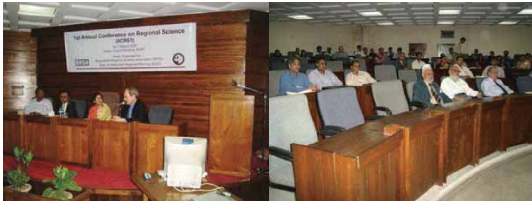
The speakers and the audience at the ACRS-1

The first ever regional science conference in Bangladesh, ACRS-1, was organized jointly by BRSA and the Department of Urban and Regional Planning of Bangladesh University of Engineering and Technology (BUET). The sessions were housed in three venues in BUET, Dhaka from March 16–17, 2007. A total of 67 papers were presented in the 17 technical sessions with 111 local and international participants.