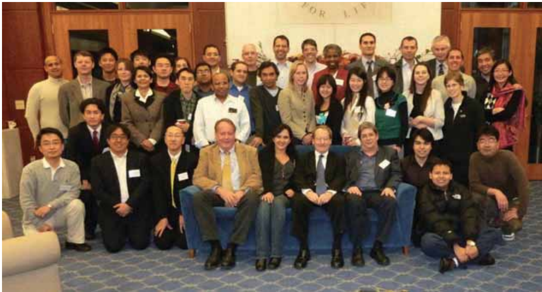
Delegates at the “20 Years of Regional Economic Analysis at REAL” Research Symposium